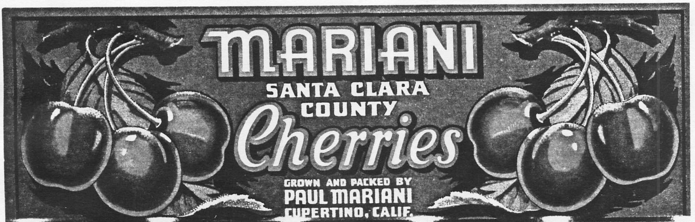
The Mariani Cherry Label, one of seven different local fruit and wine labels appearing on notecards for sale in the Museum. Notecard with envelope costs $2.00 each or 7 for $12.00

Cupertino Historical Society P.O. Box 88 10185 N. Stelling Road Cupertino, CA 95014